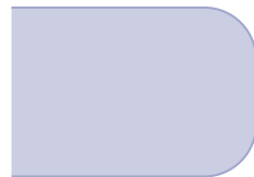
1/4" RADIUS TOP & BOTTOM