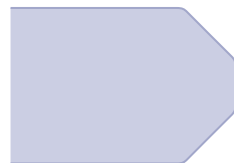
1/4" BEVEL TOP & BOTTOM